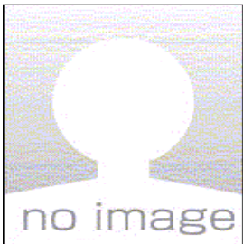
Gregory Alan Baur-, 55

750.520d1c - criminal sexual conduct 3rd degree (incapacitated victim).